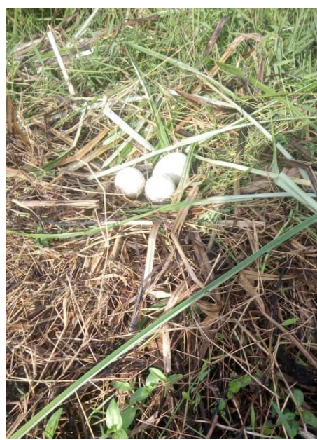
One of our Champions monitoring a Grey Crowned Crane breeding site in his area.

Another key role for the Champions is educating their fellow community members about the importance of protecting cranes and their habitats. They usually do this through joining community meetings, in collaboration with local leaders and meeting small groups of people e.g. a group of rice farmers. From September to December 2020, our team of Champions have managed to reach 1,790 community members through 16 events. Some of our Champions have become very creative with the COVID-19 restrictions restricting group meetings and found other ways to spread their messages. This Champion used a loud speaker and walked around during market day to educate his community about the importance of Grey Crowned Cranes and their habitats.