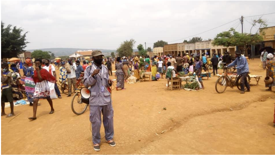
One of our Champions raising awareness within his community