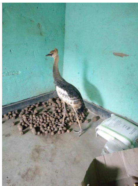
Our Champion with the Grey Crowned Crane chick rescued from poachers