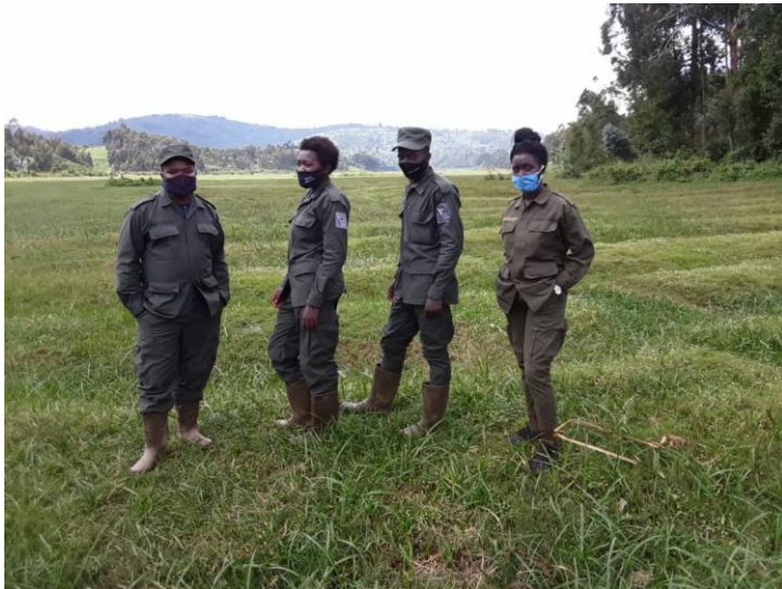
Our Rangers at Rugezi Marsh continue their patrols

RWCA staff have been regularly calling and consulting with the team of Rangers to receive feedback, follow up and advise on challenges, and provide encouragement. The work of the Rangers has been particularly important at this time as we have seen an increase in illegal activities such as women cutting grass from the Marsh to make mats, a small increase in fishing and some hunting activities. We work closely with the communities to understand the changes such as the economic impact of COVID-19 and an increase in poverty and hunger and try to respond appropriately.