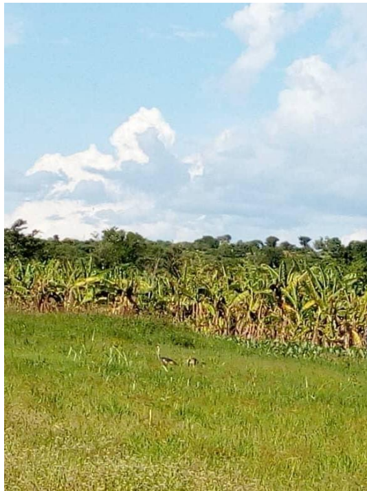
The Crane chick reunited with its parents