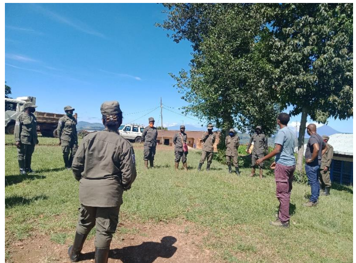
RWCA staff visit the Rangers to discuss the successes and challenges of their work and find solutions to any problems.

A large part of the Rangers' role is education and in addition to their patrols, they find opportunities for community education. Despite restrictions of COVID-19, they were able to reach 878 community members through 11 events to raise awareness between September and December 2020.